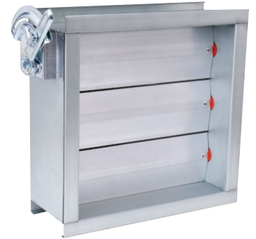
Rectangular Volume Control Damper