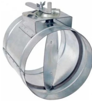
Round Volume Control Damper