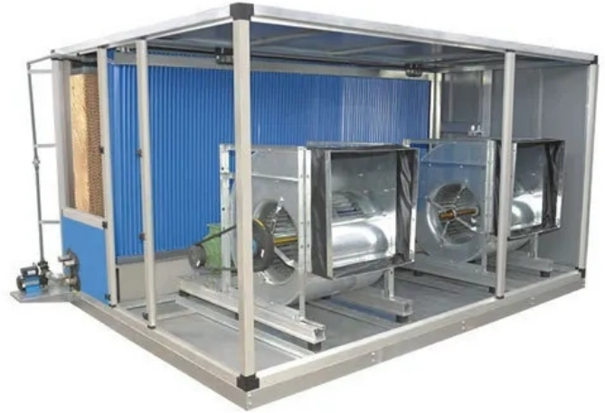
Air Washer Unit