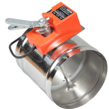
Round Motorized Volume Control Damper