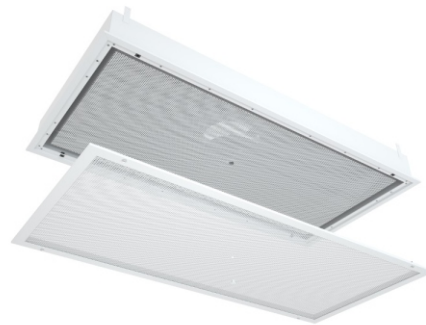
Laminar Flow Diffuser