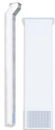
Return Air Riser