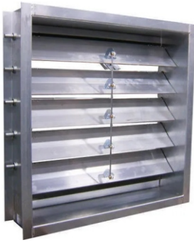
Back Draft Damper