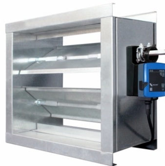
Rectangular Motorized Volume Control Damper