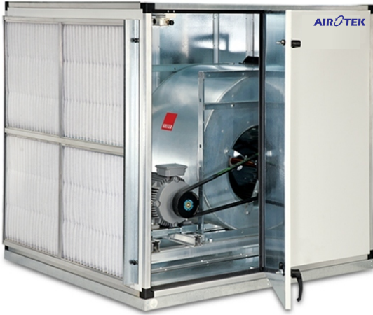
Fresh Air Unit