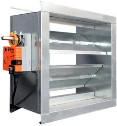
Rect. Motorized Damper