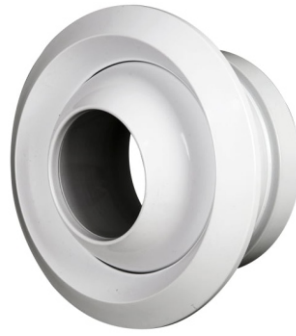
Jet Nozzle Diffuser