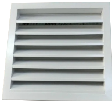
Large Format Louver