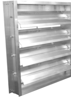
Aluminum Collar Damper