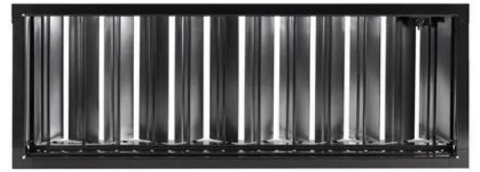
MS Collar Damper