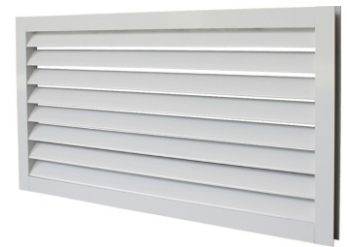
Short Format Louver