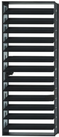
Opposed Blade Collar